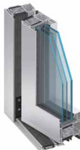
MB-104 Passive SI, RC3

Examples of heat transfer coefficients U_D