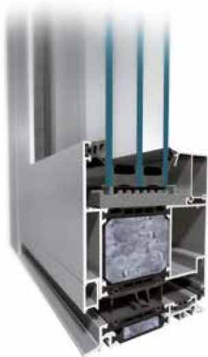
MB-104 Passive SI